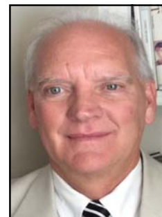
Tax Commissioner Wayne Bridges