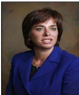
Probate Court Judge Alice Padgett